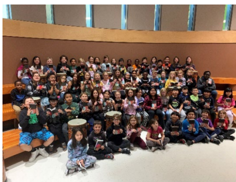
École St Anne thank the K of C for their donation of Bibles for all students of Grade 4!