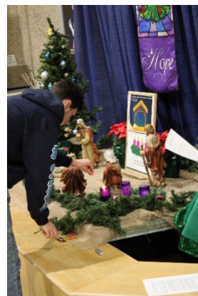
École St. Mary High School lighting the candle for Hope