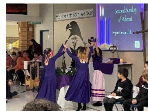
St. Michael student dancers

Merry Christmas! Jesus is the Reason for the Season