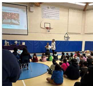
St. Catherine school wide celebration