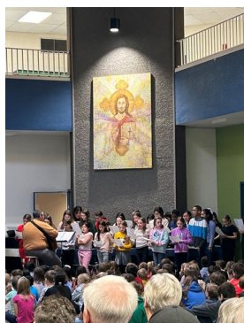
École Holy Cross students lead the school in song their Advent Celebration