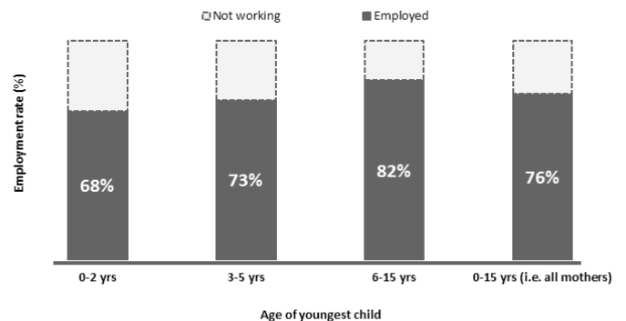
Employment rates among mothers with children aged 0-15 yrs, Saskatchewan, 2014

Statistics Canada (CANSIM) Table 2820211 - Labour force survey estimates (LFS), by family type and family age composition, annually